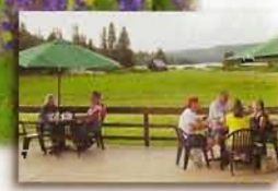
Enjoy dining at our Restaurant and Bar