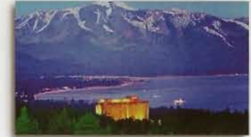
South Lake Tahoe and the Casinos at Stateline, Nevada are just 30minutes away.